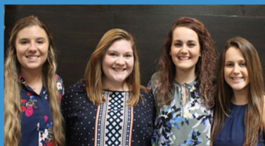
Student director and leaders