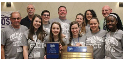
1 st Place Quiz Bowl - Columbus State Community College - Columbus