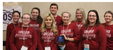
2 nd Place Quiz Bowl - Sinclair Community College Dayton